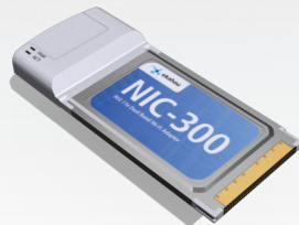
NIC-300 Survey Adapter